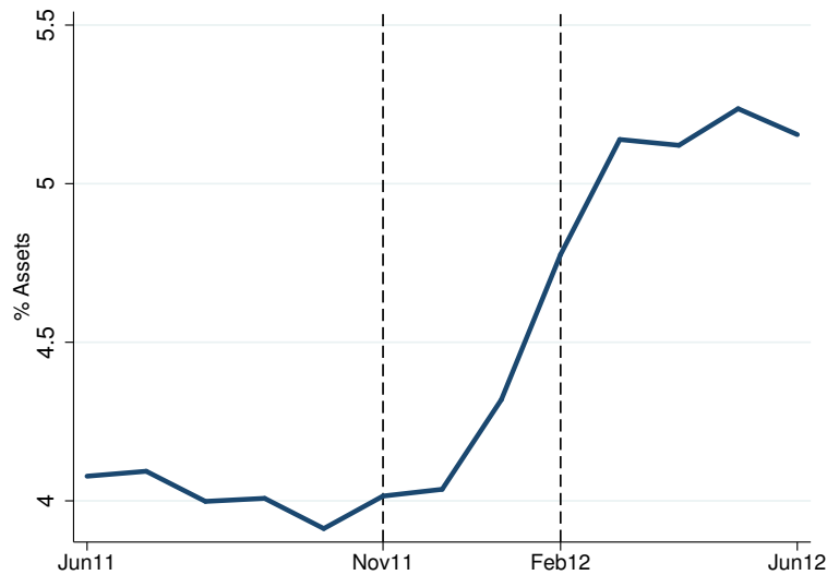
Figure E.2: Holdings of Domestic Government Debt, Normalized by Assets. This figure plots the evolution of domestic government bonds held by banks, divided by total assets, from June 2011 to June 2012. The two vertical dashed lines delimit the LTRO allotment period.